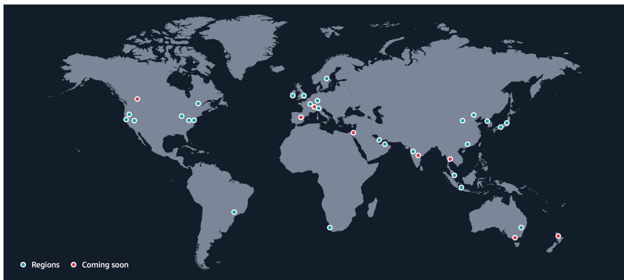
Figure 1) AWS Global Infrastructure Map

Depending on your organization's needs, you may want more silos for DEV or QA groups. Non-production systems like these generally do not have the same SLA demands as the production or staging environments, so they can be configured for a single AZ.